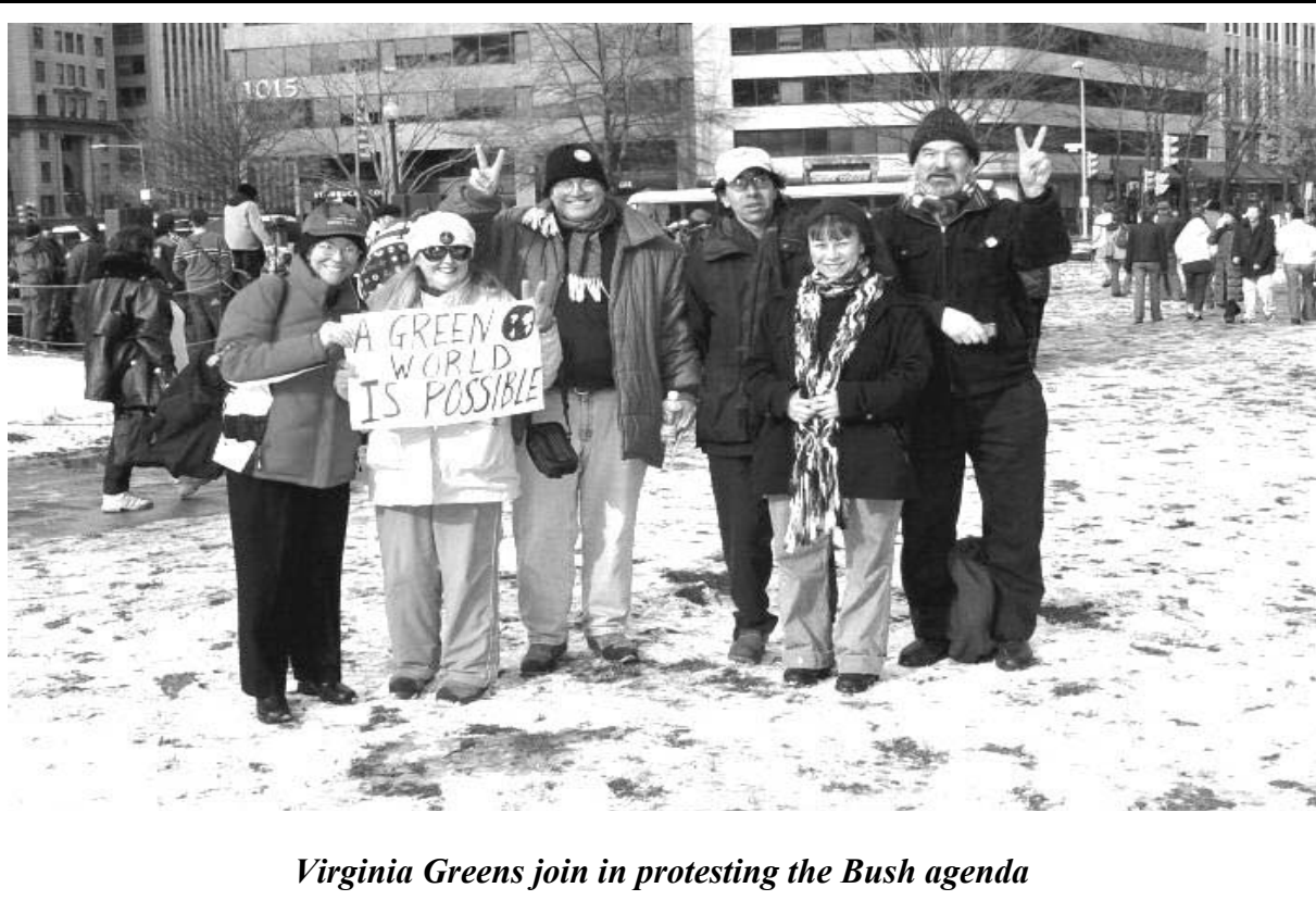
Virginia Greens join in protesting the Bush agenda

When future generations look back, let them not have cause to curse our names. Rather, let them say that this was the day, let them say that this was the place, that ours were the voices that brought this insanity to an end. Because if not here, where? If not now, when? If not us, who?